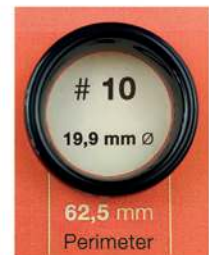
example how to do

Use your own ring to measure your Ring2Pay size. Place your ring on the circles below and see if the inside matches the white part. Your ring is the right size when you only have a white circle in your ring. If you are unsure whether your size fits between 2 measures, advise to order the larger size.